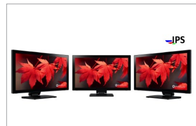
IPS panel provides superb clarity from all viewing angles