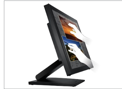
Integration of 10-point touch and projected capacitive touch technology provides accurate and precise touch experience