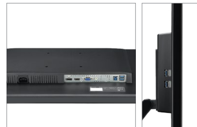
Versatile connectivity: VGA, HDMI, DisplayPort and USB port allow for effortless system integration